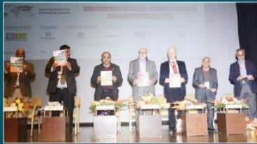
CMEE flashback 2011-16 release in 2017 Annual conference of EMCB