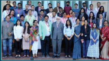
Workshop on Teaching/Practicing Marketing Research held in January & November 2019