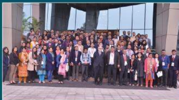
2017 Annual conference Group Photo