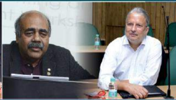
Case Study Writing and Development Workshop, Jan 2017