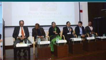
Important plenary sessions in 2017 Annual conference